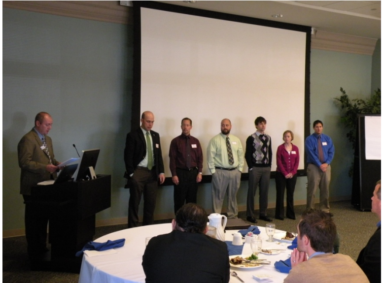
November 23 rd , 2010 Recognition Luncheon.