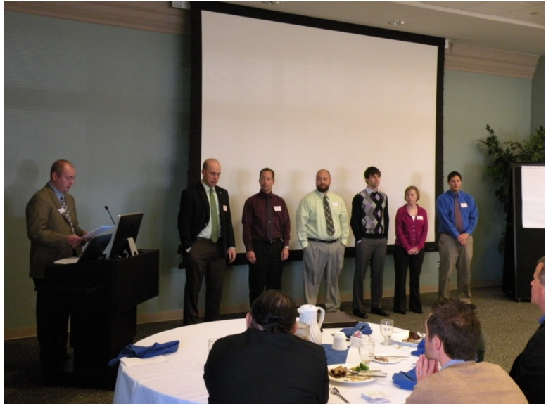
November 23 rd , 2010 Recognition Luncheon.